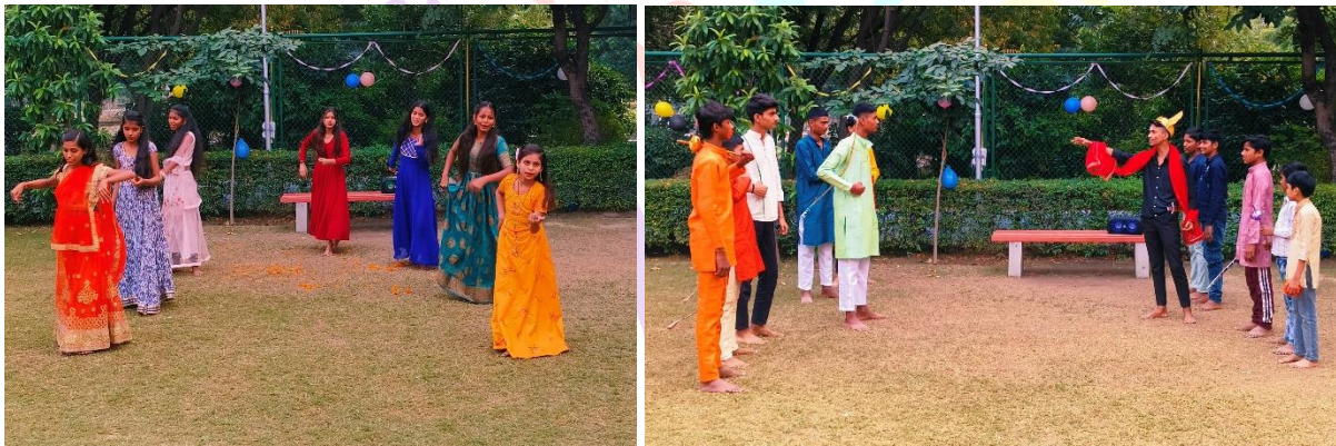
Children performing dance and skit on Dusshera celebration

In the Dussehra celebration children took part in a Ramayana skit followed by a dance and then dinner.