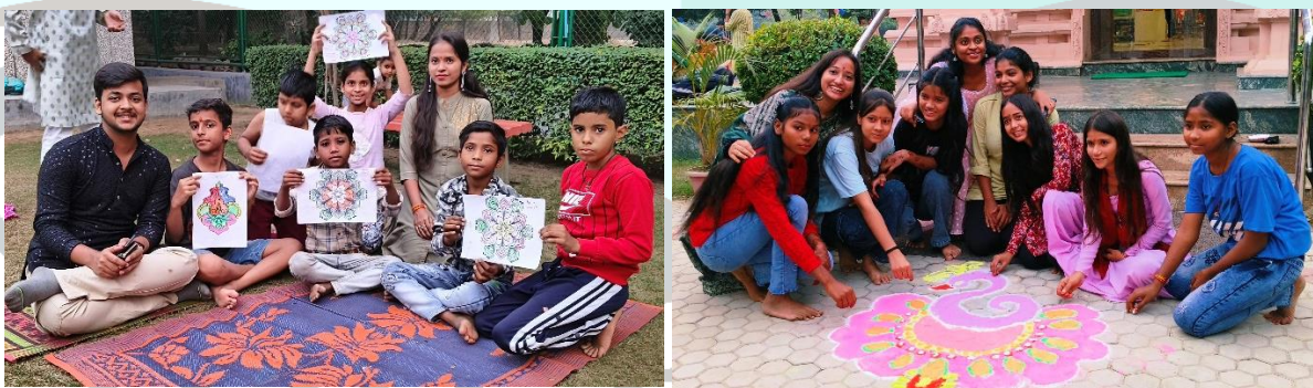
Rangoli and drawings made on Diwali Occasion

Similarly, we had a very cheerful event for Diwali starting with rangoli painting, and diya painting followed by distribution and then food.